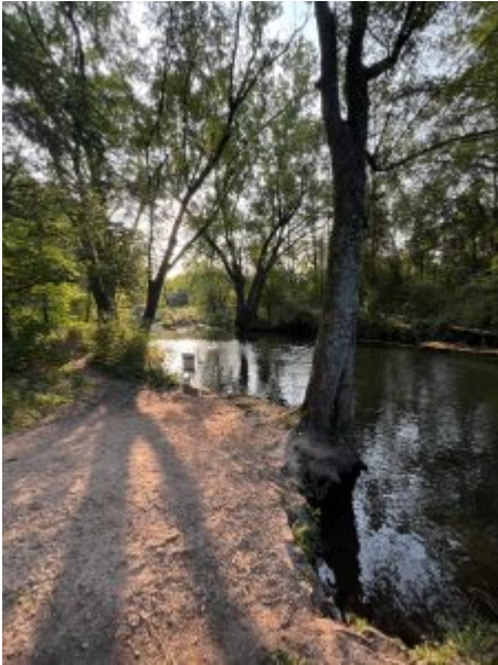
The river at the entrance point