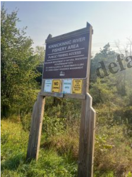
Sign at the exit point parking lot