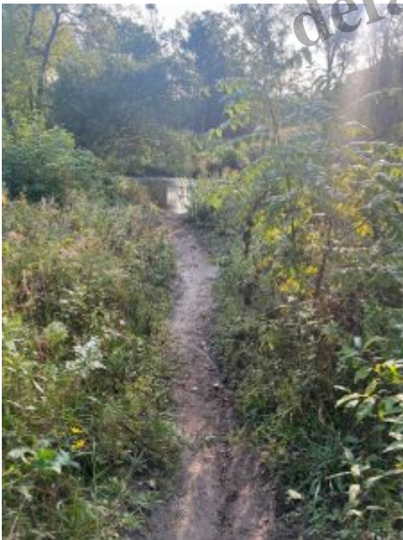
Part of the path closest to the river

The main place people exit the upper Kinni is at a parking lot right across from Aldi's grocery store in River Falls, Wisconsin. A little bit before the exit point, you will go under two bridges right next to each other. These are the bridges for the north and south bound lanes of highway 35. As you continue a little bit more you will exit on the right side of the river before you get to another bridge. The path leading from the river to the parking lot is about two or three times as long as the entrance point path. The path to the parking lot is a slight incline. There is not a lot of room for a bunch of kayaks to sit on the riverbank here, so it is important that you pull your kayak out of the water and not leave it there for a long time.