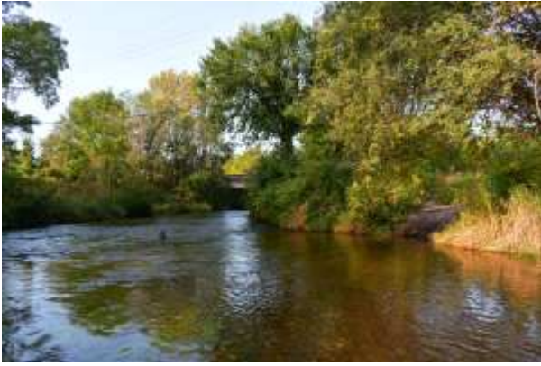
Exit point view from River

The main place people exit the upper Kinni is at a parking lot right across from Aldi's grocery store in River Falls, Wisconsin. A little bit before the exit point, you will go under two bridges right next to each other. These are the bridges for the north and south bound lanes of highway 35. As you continue a little bit more you will exit on the right side of the river before you get to another bridge. The path leading from the river to the parking lot is about two or three times as long as the entrance point path. The path to the parking lot is a slight incline. There is not a lot of room for a bunch of kayaks to sit on the riverbank here, so it is important that you pull your kayak out of the water and not leave it there for a long time.