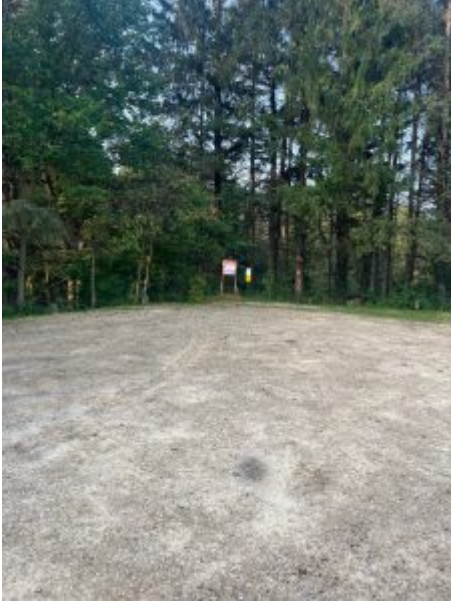
Parking lot at entrance point