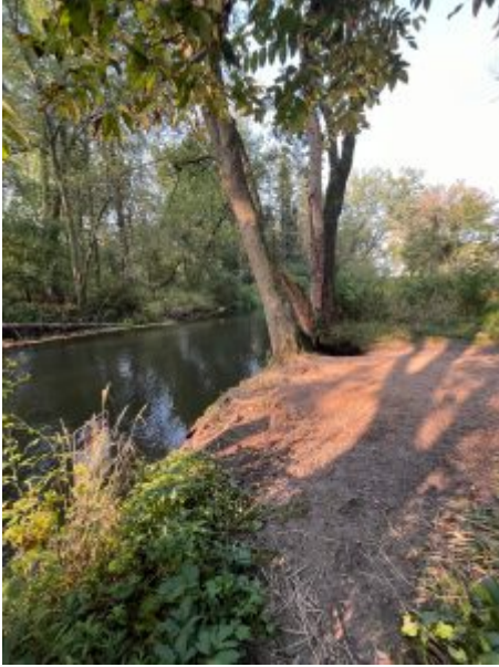
The river at the entrance point