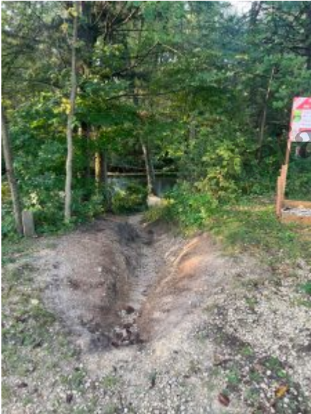
Trail from parking lot to river