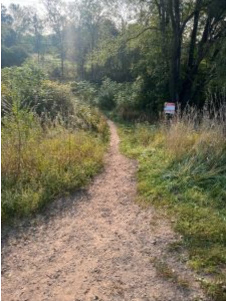
Part of the path closest to the parking lot